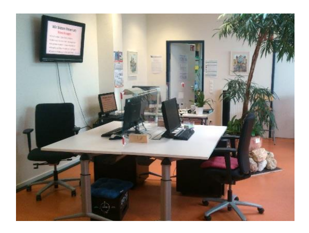
We would gladly help you with your correspondence and papers